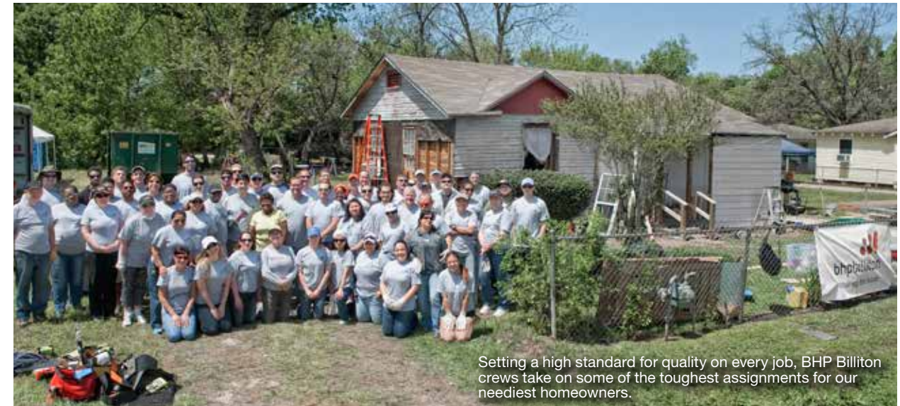
Setting a high standard for quality on every job, BHP Billiton crews take on some of the toughest assignments for our neediest homeowners.