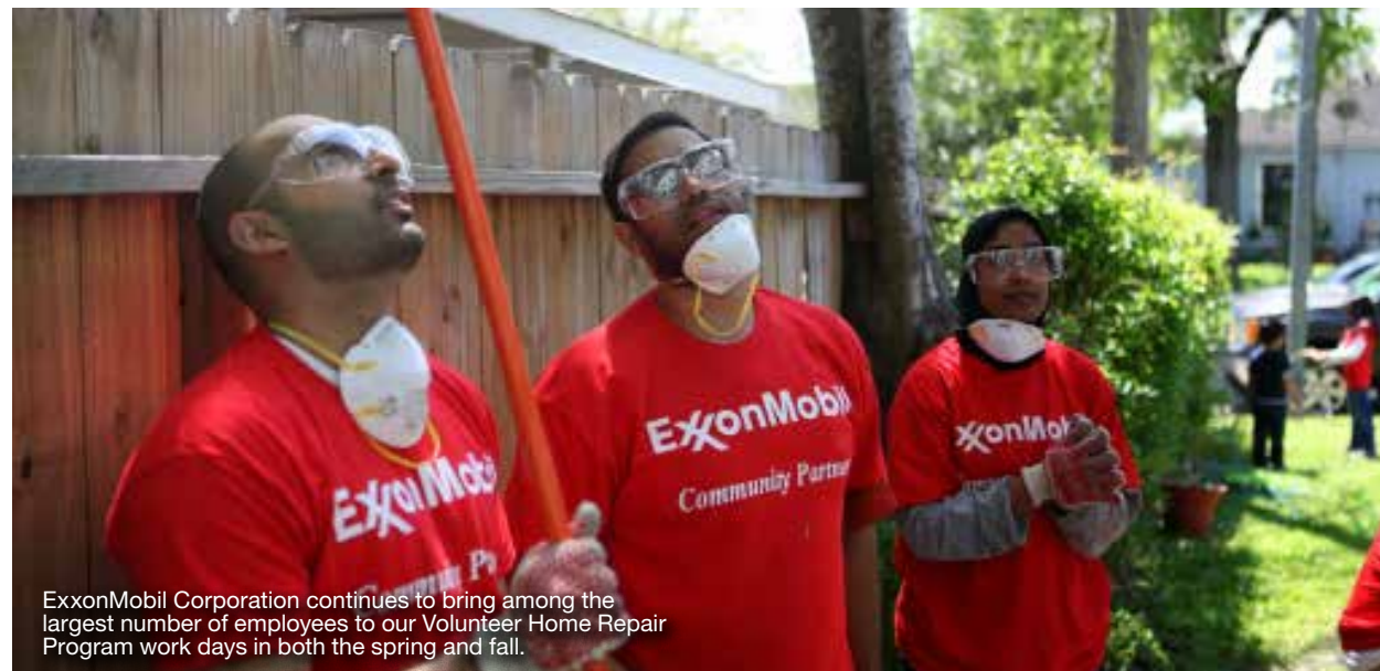
ExxonMobil Corporation continues to bring among the largest number of employees to our Volunteer Home Repair Program work days in both the spring and fall.

I am pleased to announce that support for the RTH mission and programs has increased during the first half of the year. New or significantly increased gifts have been received from Houston Housing Finance Corporation, Isla Carroll Turner Friendship Trust, Camden, BHP Billiton, David Weekley Homes, and the Texas Veterans Commission, among others. The RTH Board of Directors and Staff have generously increased their giving levels, with both groups reporting 100 percent commitment from their membership. We currently stand at $446,000 at this midway point in our fiscal year and will require $554,000 to finish out the year and help the large number of homeowners we have committed to assisting in 2014. Your help is greatly welcomed and appreciated!