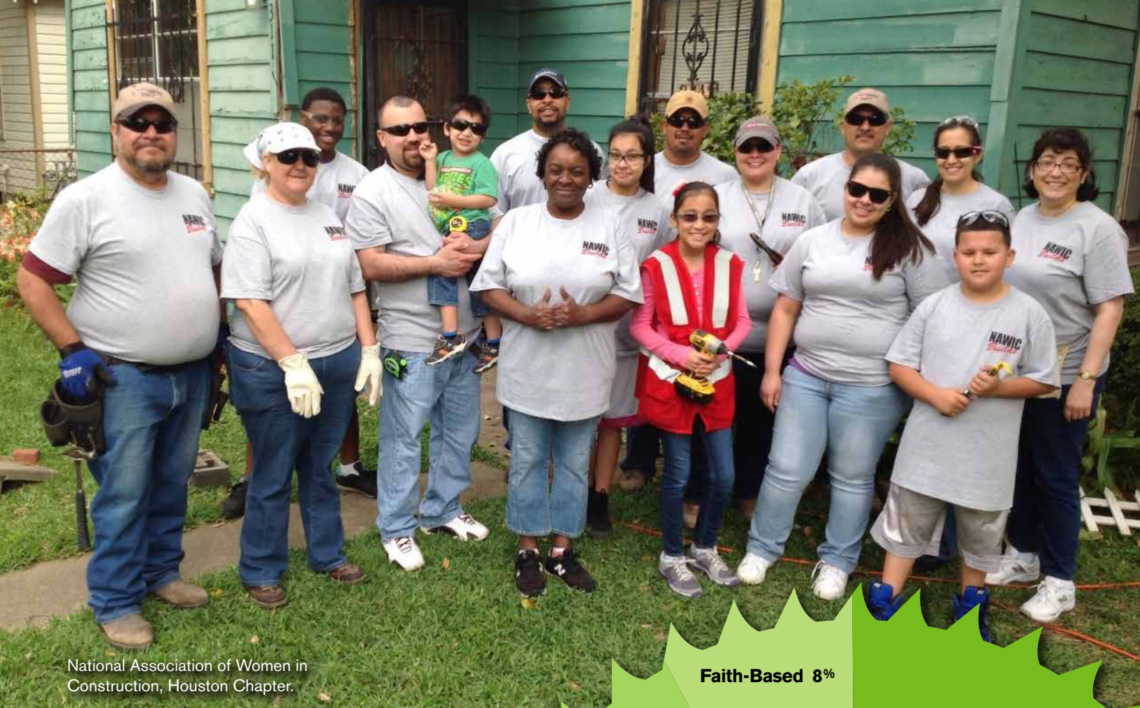
National Association of Women in Construction, Houston Chapter.